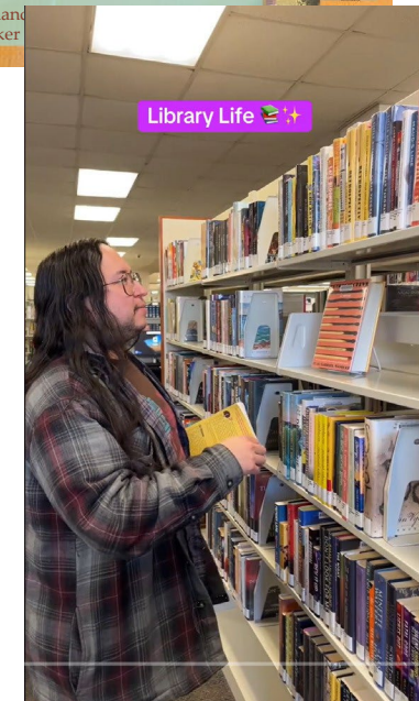
Click the photo above to view the TikTok