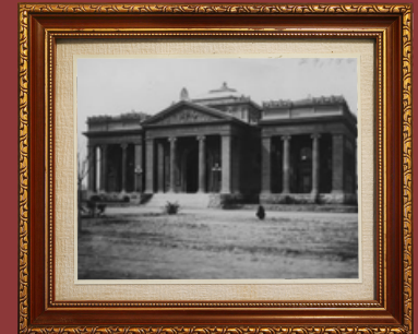
Carnegie Library, circa 1905.

Tucson's first free public library opened in 1901 in the building currently occupied by the Tucson Children's Museum. Click here for more of the story.