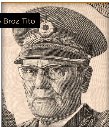
Josip Broz Tito

The Partisans enjoyed several advantages. Unlike the Ustasha or the Chetniks, they were explicitly multiethnic in focus, not limited to a single group or a single region. In addition, the Partisans were fully committed to the fight against the Axis.